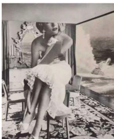
Clockwise from above: 'The Call' (1953) by Toshiko Okanoue. 'Gadjunbattit (Life Lines)' (2009) by Britta Marakatt-Labba. 'Purple and Rose: The Lange Leizen of the Six Marks' (1864) by James Abbott McNeill Whistler

A painter in her own right, Joanna Hiffernan was also the maverick artist James Abbott McNeill Whistler's studio manager, muse, lover and companion. Through 70 of his canvases, the Royal Academy reveals Hiffernan's influence on her friend's life and work from the 1860s until her death in 1886 at the age of just 46. Meanwhile, Tate Modern shines a light on hitherto-overlooked names of the 20th century such as Toshiko Okanoue, Simone Breton, Nusch Eluard and Lula Vuco, who profoundly influenced the Surrealist movement but have historically been overlooked as scribes or sidelined as inspiration for their male contemporaries. In a smaller – but just as perfectly formed – display at Ikon in Birmingham, the Swedish artist Britta Marakatt-Labba's luminous depictions of fishermen, shamans and children sledding in the snow arrive in a solo exhibition that will surely enchant all who visit.