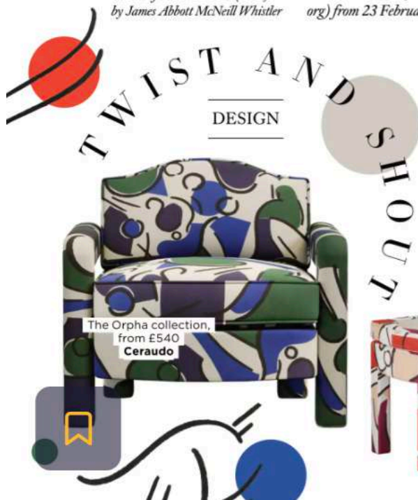
The Orpha collection, from £540 Ceraudo